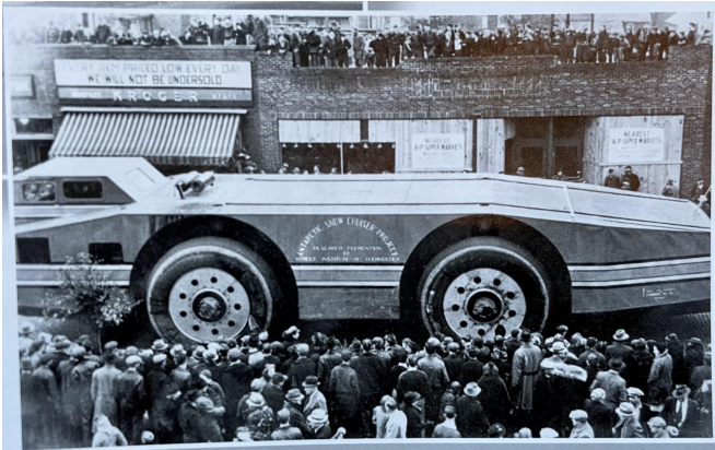
The Snow Cruiser in Downtown Wadsworth, 1939.

Eighty-three years ago, Admiral Richard Byrd was on his way to the South Pole with the Snow Cruiser. It was driven from Canada, where it was made, to Boston via Route 224, the main road through Wadsworth. At 30 mph top speed, it took several days to arrive at its destination. Students at Centralized School -- now Isham School -- were released from class at 2:00 in the November afternoon of 1939 to watch it go by the school. It stopped at the intersection of Watrusa and College Streets for people to examine it up close. It went from Boston to the South Pole by ship, and when it was unloaded from the ship, it broke the timber gangplank and landed in the snow, but the smooth 10' Goodyear tires wouldn't permit it to go farther. It lies deep in snow-covered layers of ice in Antarctica.