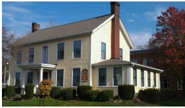
Wadsworth Brick & Tile Company The Johnson House Museum

The Wadsworth Area Historical Society at the Johnson House Museum, the "Yellow House" located at 161 High Street near City Hall, is an organization committed to preserving the history of Wadsworth and surrounding areas.