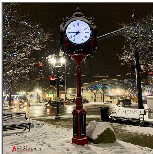
High Street Clock