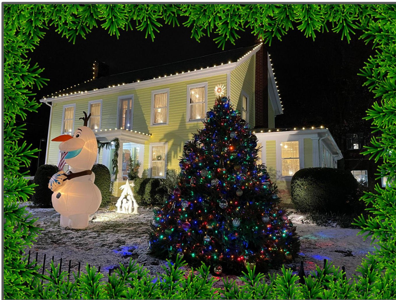
Museum with Olaf - Christmas 2022