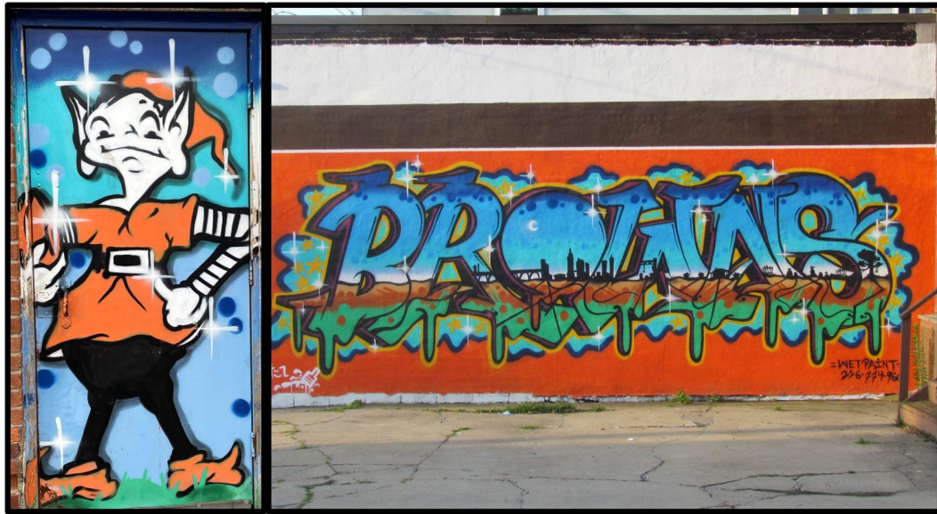
Browns South End Graffiti Mural