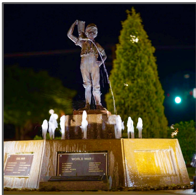
Boy with the Leaky Boot Statue

The Wadsworth's Outdoor Art Gallery continues to grow each year! A visit to Woodlawn Cemetery, less than a block from downtown Wadsworth, enhances the Art Gallery experience with the display of various sculpted statues such as the Curtis Monument, John McGregor Monument, the bronze Civil War Soldier Monument, the Tomb of the Unknown Soldier, the Simon Elliott monument, the mausoleums and all the unique hand-carved tombstones that are truly works of art!