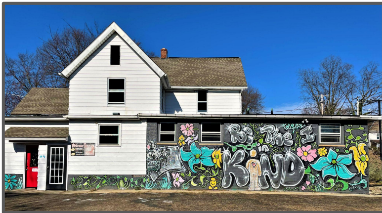
Teen Center, North Pardee Graffiti Art