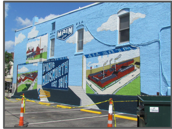
Injector, Salt and Match Companies on Main Street